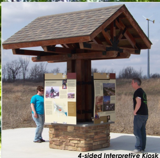
4-sided Interpretive Kiosk